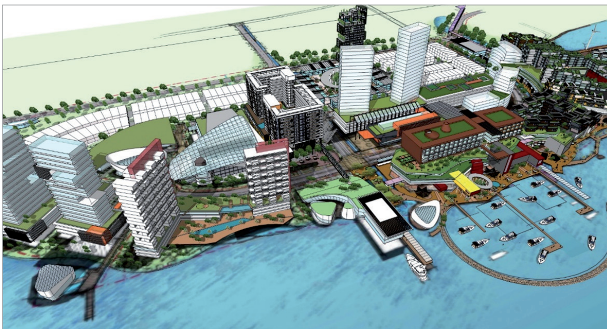
Master Layout Plan of PD Waterfront Development.