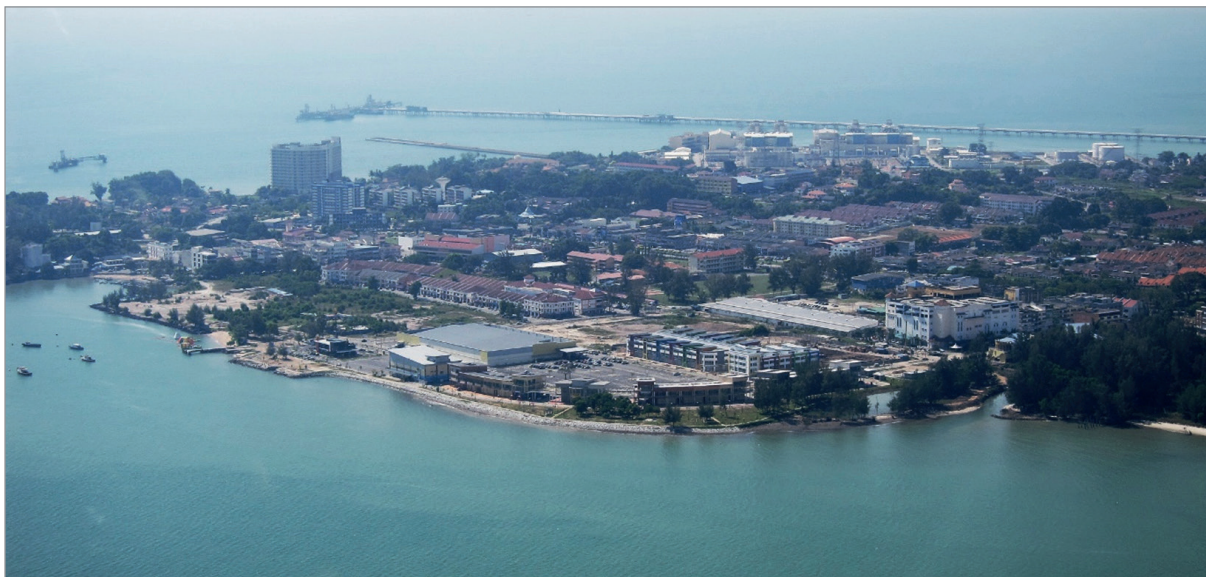
View of the project development site

Located in the historical 1st Mile Jalan Pantai, PD Waterfront has attracted many local residents and has boosted tourism visits in the district. This has proven that there is tremendous potential to place Port Dickson onto the world stage in its quest to become an international tourist destination. This project is expected to be completed in several phases over the next eight years.