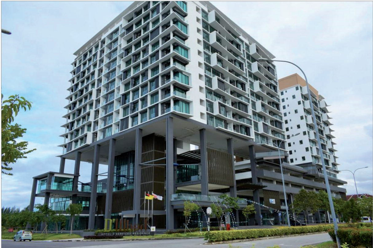
TSR will officially launch Condotel by August this year together with their 28 units of the 2 & 3 storey commercial shop lots at PD Waterfront. The Condotel will consist of 365 units with 2 new blocks facing the seafront which were pending for authority to approved.