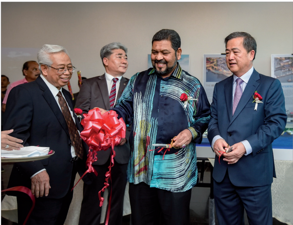
After the signing ceremony, YB Dato' Haji Tun Hairudin had launched the new masterplan for PD Waterfront that will transform Port Dickson onto the international tourist destination with ultimate oceanfront experience.