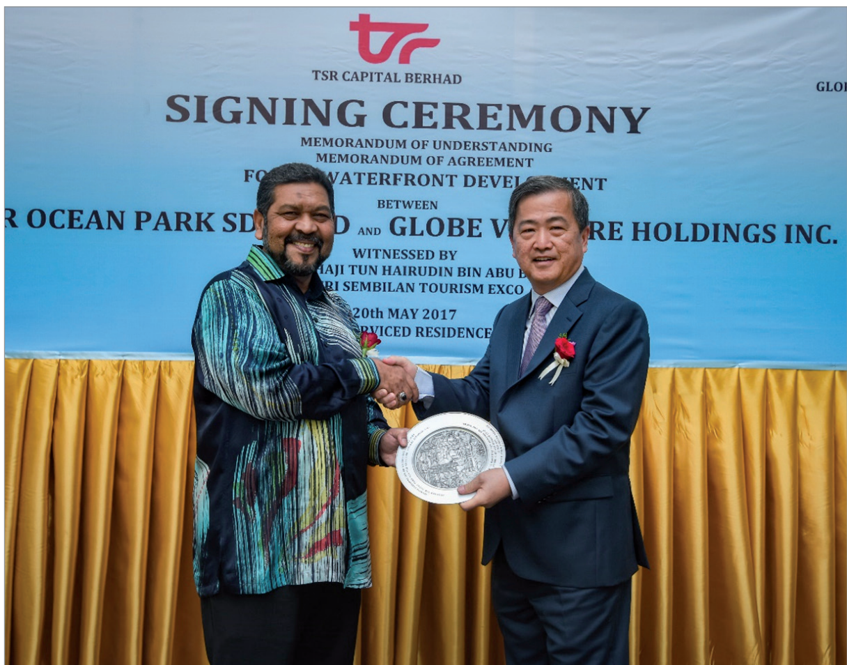
Presentation of Token of Appreciation to YB Dato' Haji Tun Hairudin – Negeri Sembilan Tourism Exco.