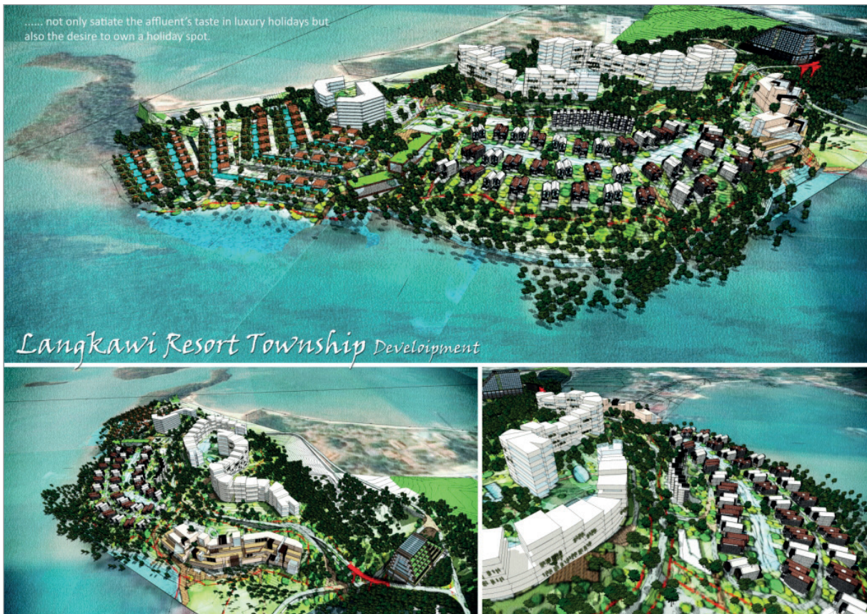
"Beacon Langkawi Development" will be a family centre for leisure and entertainment in collaboration with well-known operator. The entire development shall be network in eco green, friendly, easy and soothing access in lush park setting. The best of Urban Town Planning, Architectural Design and Resort Management will be incorporated. It will be an international resort township that Malaysians will be proud of.