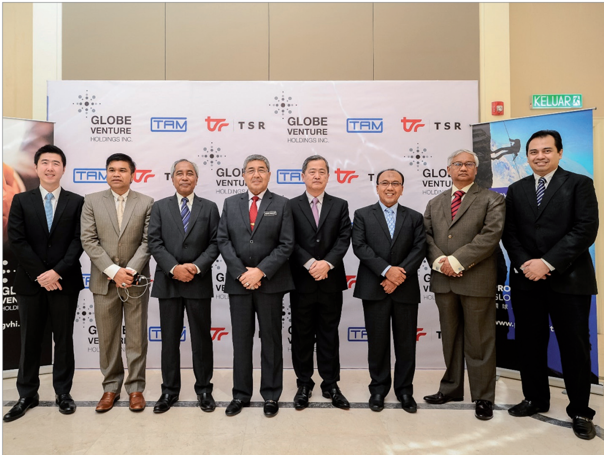
The management team of TSR Capital Berhad and Terusan Al-Maju Sdn Bhd allowing with Dato' Seri Diraja Ahmad Bashah bin Md. Hanipah, Menteri Besar Kedah Darul Aman in the middle of this photo.