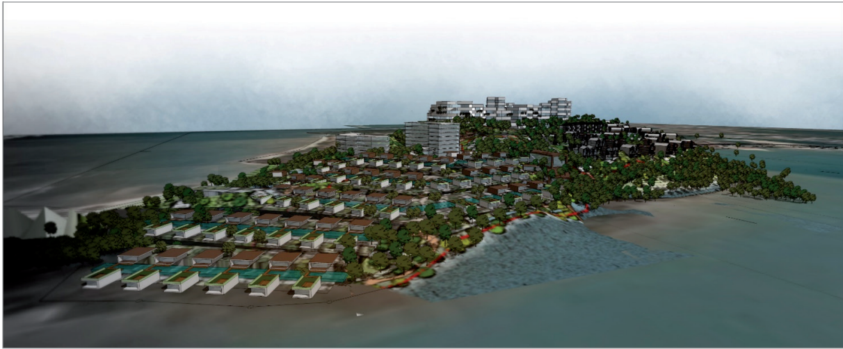
Masterplan of "Beacon on the Hill" Development